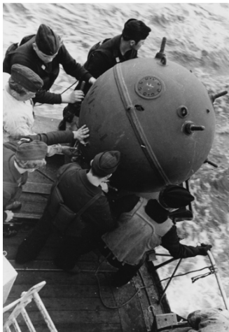
Example naval mine